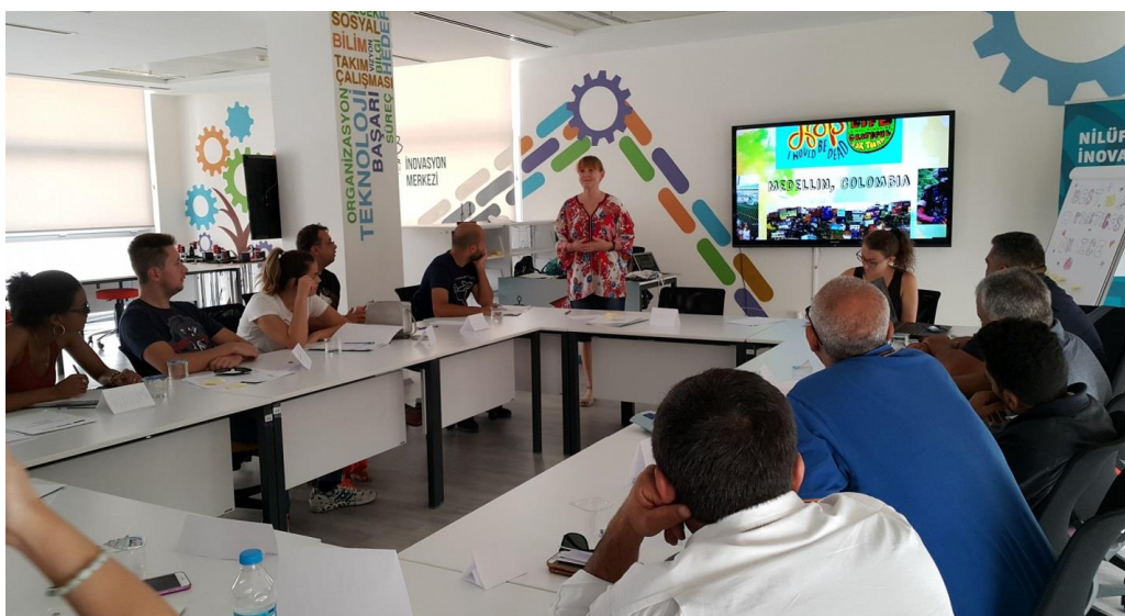
Workshop - Bursa