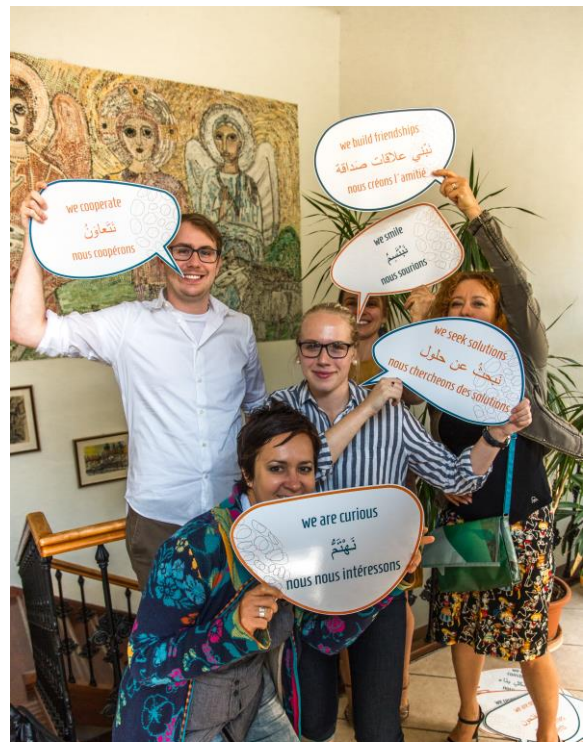
Participants - Olomouc

Olomouc (Czech Republic) 7-11 September 2017. The Czech Republic HoN, in partnership with 6 other Networks organised “Be Effective! Learning and Sharing” event. The 3 days meeting gathered 45 in interactive sessions and working groups designed to equip them with effective communication skills and capacities to reach a wide range of audiences and convey the message in an innovative and attractive way to combat xenophobia and extremism in CEE societies and to inspire and fuel a constructive and inclusive dialogue within societies. The meeting also covered the topic of ‘media tools and its proper use’ to deconstruct stereotypes about refugees and promote cooperation. In addition, a one day training on non-violent communications (NVC) skills took place to introduce the principles of NVC to the participants who could then use the newly-acquired knowledge in practical exercises. In the last day, the participant were invited for a hike for networking, followed by a session by Konrad Pedziwiatr, ALF Report author, to present the survey results.