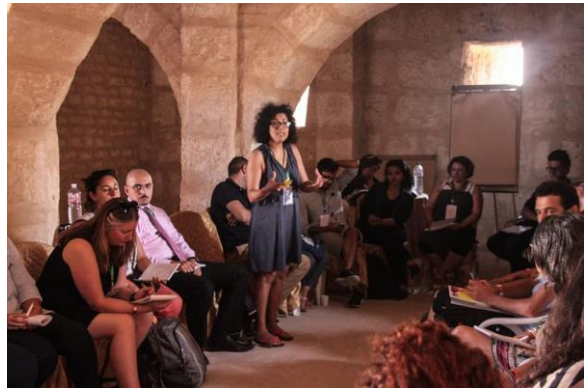
Workshop – Sousse

Sousse (Tunisia) 26-31 August 2017. The Tunisian HoN collaborated with 12 Networks and brought more than 100 young people, NGO leaders and experts from the Euro-Med region to reflect on current challenges and share experiences. The event was composed of six workshops to discuss the role of arts in war zones, refugee camps and marginalised areas and its role in helping victims of violence, exclusion and radicalisation. There was also a crafts fair and an artistic component. The event was a continuity of the Euro-Arab Youth Forum organised in partnership with the “Sfax Capital of Arab Culture”.