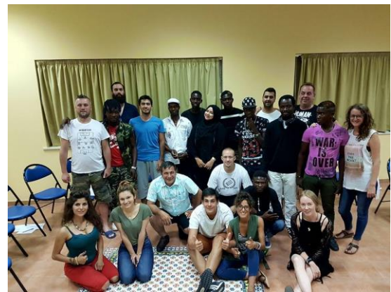
Participants – Mazara del Vallo