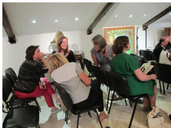
Workshop – Naples