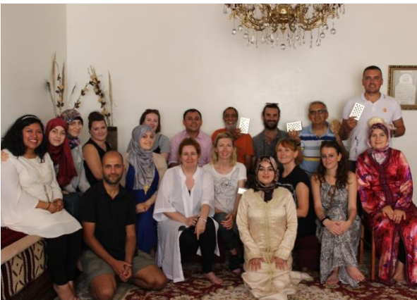
Participants - Tangiers

The 3.S project organised 3 activities in Tangiers (2-8 August), Mazara del Vallo, Italy (17-23 August) and Bursa, Turkey (7-15 September) to strengthen the advanced level of mutual understanding and to develop an Intercultural Citizenship Education (ICE) platform in the Euro-Med region.