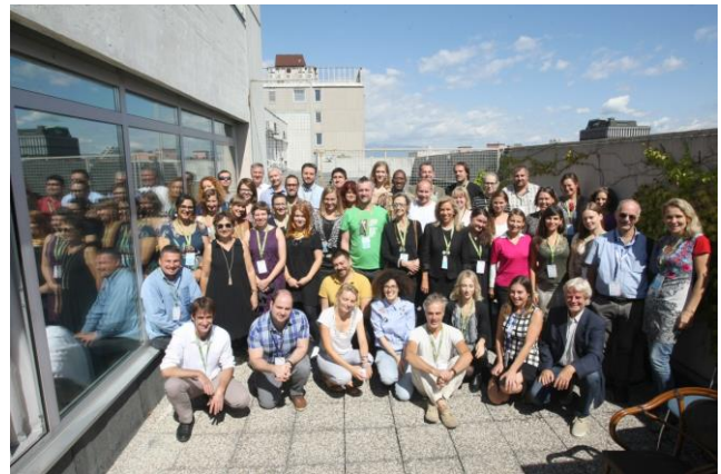
Participants - Ljubljana