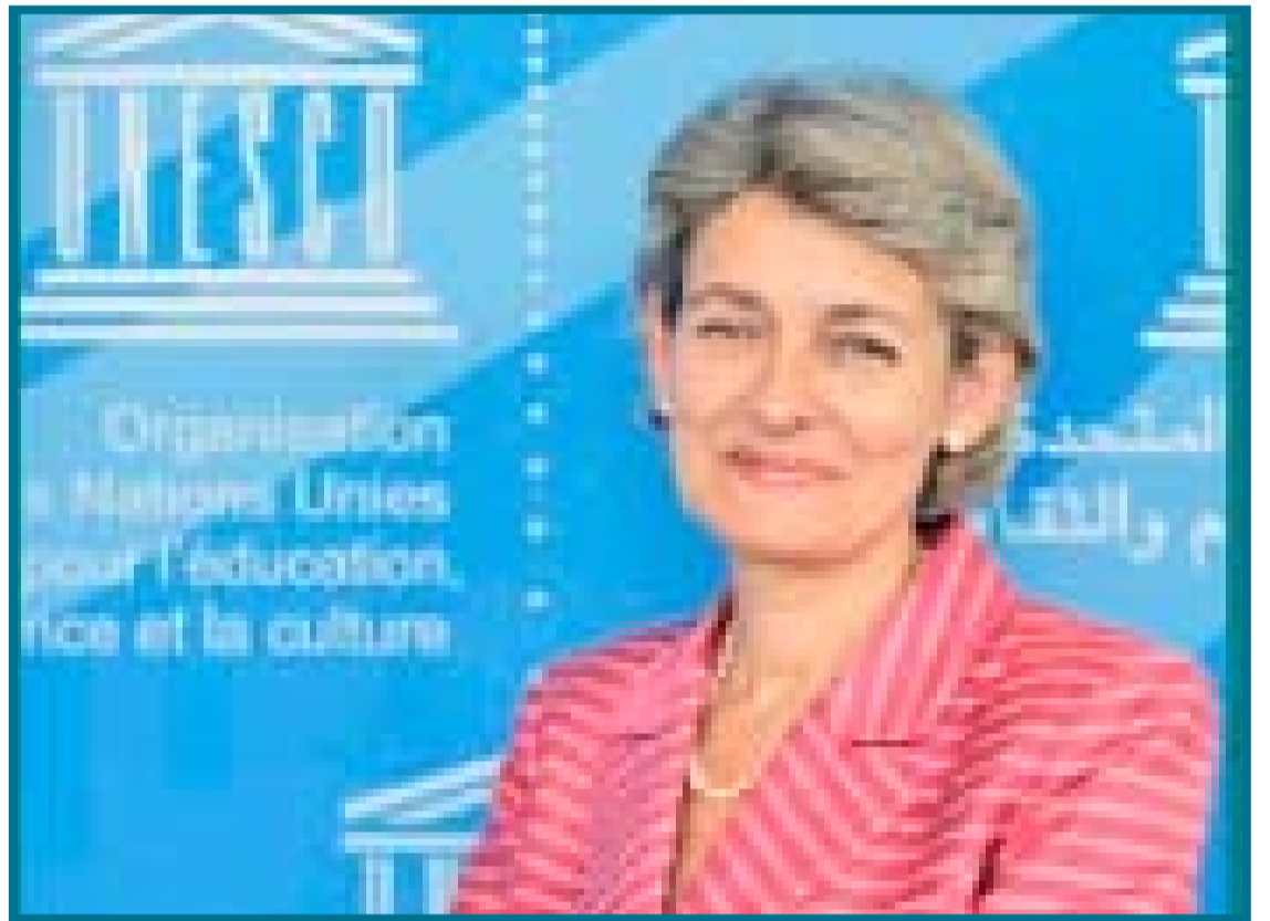
Irina Bokova, Director General of Unesco – Mediterranean Award