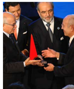
Mediterranean Award for Social Solidarity to Associazione Scuola di Pace Italy

An associative and institutional body that is strongly committed to promoting cooperation between National energy regulatory Bodies in the Mediterranean thus contributing to effectively supporting energy, economic and social integration among Countries of the Mediterranean Basin and the Continents to which they belong.