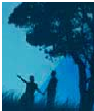
Mediterranean Award for Civil Society to Youth Resource Centre (ORC) Tuzla

For its long-standing commitment to the energy revolution as a response to climate change, defending our oceans, protecting the last of our primary forests (together with the fauna, flora and human beings that depend on them), working for disarmament and peace by dealing with the causes of conflicts, and calling for the elimination of all nuclear arms to create a future without toxic substances in which sustainable agriculture is promoted.