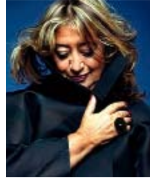
Mediterranean Award for Architecture to Zaha Hadid

For their commitment in promoting the dialogue among cultures and civilizations involving youth. In particular, for spreading among the students the idea that we all belong to the human race, which is only one, cancelling the differences in view of a better understanding of the other, so as to reach a peaceful coexistence among people of different cultures and religions.