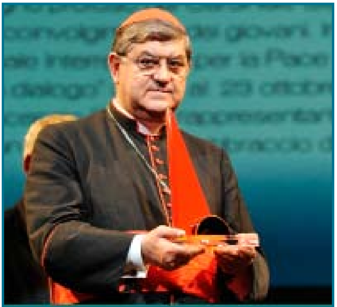
Archbishop Crescenzo Sepe – Mediterranean Award