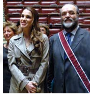
H.M. Rania of Jordan – Mediterranean Award