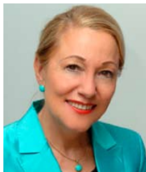
Mediterranean Award for Institutions to Benita Ferrero-Waldner

For her action in defence of children's rights and, in general, for her commitment in favour of abandoned children. President of the Observatoire National des Droits de l'Enfant (ONDE) and reference point for UNICEF both in Morocco and across the World, she has made every effort for children's education, saying that "it is not quite important which kind of world we are leaving to our children, but rather which children we are leaving to this world".