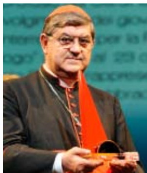
Mediterranean Award for Peace to H.E. Cardinale Crescenzio Sepe Italy

For his commitment in promoting dialogue among cultures and civilisations involving youth. In particular he has been the promoter of the 21st Interfaith International Peace Meeting entitled "For a world without violence, dialogue between religions and cultures", held in Naples from 21st through 23rd October 2007. Cardinal Crescenzio Sepe has also the merit of instituting, in the year 2011, a "Special Jubilee" for Naples, involving all the citizens in the task for the renaissance of the city.