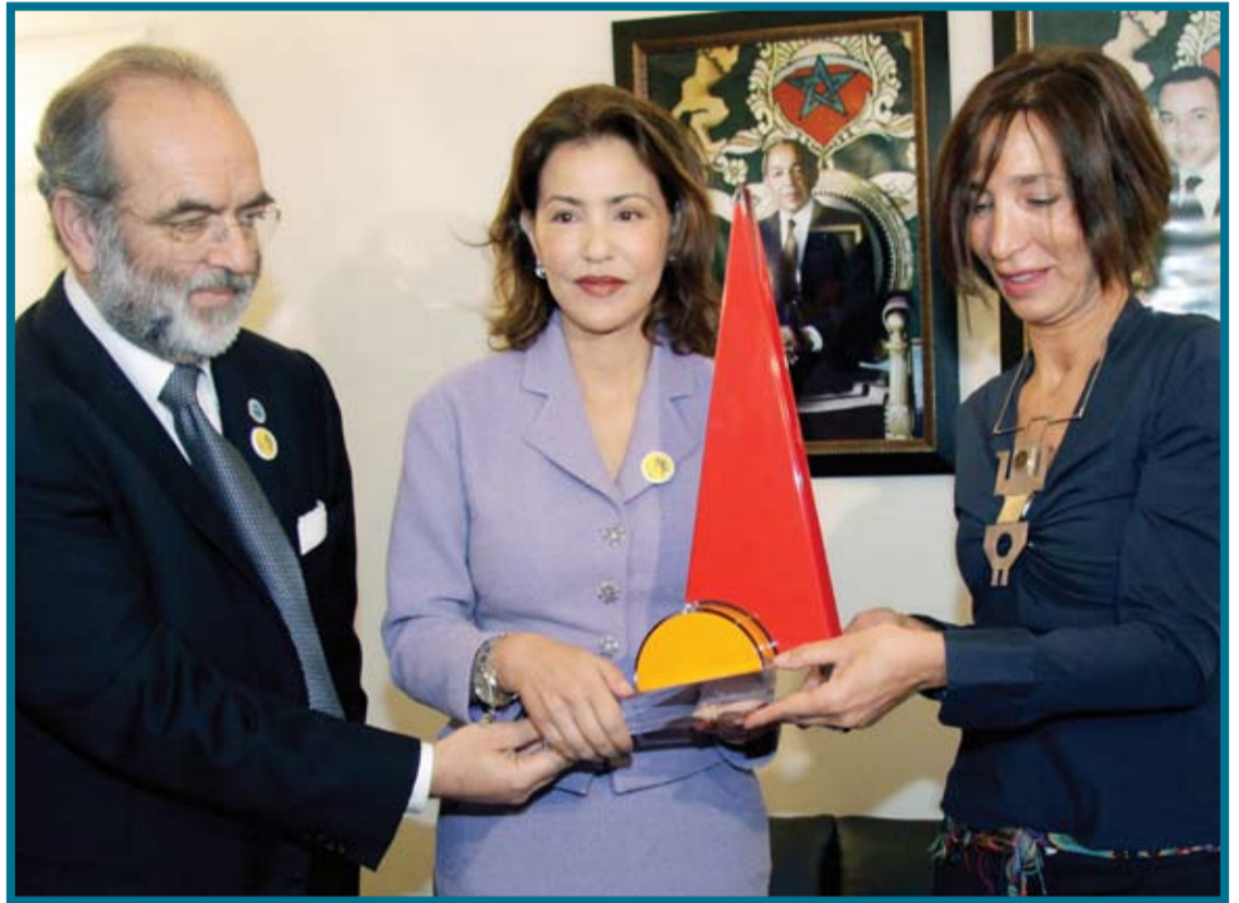
H.R.H. Princess Lalla Meryem – Mediterranean Award

In 2012 was instituted the section Mediterranean Award for Archeology to the memory of Marcello Gigante.