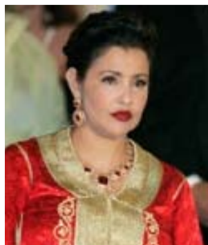
Mediterranean Award "Rita Allamprese" for Children to H.R.H. Princess Lalla Meryem Morocco

For his commitment in promoting dialogue among cultures and civilisations involving youth. In particular he has been the promoter of the 21st Interfaith International Peace Meeting entitled "For a world without violence, dialogue between religions and cultures", held in Naples from 21st through 23rd October 2007. Cardinal Crescenzio Sepe has also the merit of instituting, in the year 2011, a "Special Jubilee" for Naples, involving all the citizens in the task for the renaissance of the city.