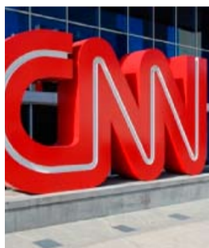
Mediterranean Award for Media to CNN

For their immediate and impassioned availability to support Mediterraidd project through technological skills and communication abilities, so that it becomes a connection language with the Italian cultural world thanks to RAI web portal. Rai Nuovi Media confirms the central role of the public broadcasting service even in the context of new digital media through a strategy of communication subsidiarity which enables any subject to be protagonist of its own messages both in the national and international field.