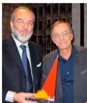
Mediterranean Award for Culture to Roberto Vecchioni Professor, songwriter Italy

For the activity carried out through practical projects in the field of research on genetic and rare diseases, in order to find in the short run specific treatments to save human lives, especially those of children. Telethon has the merit to have been able to use the donations received in a transparent way and with results that everybody can check