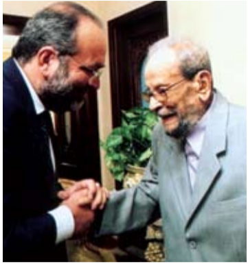
Naguib Mahfouz – Mediterranean Award