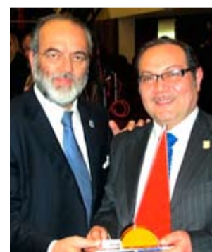
Mediterranean Award for Art and Creativity to Italian Association "Amici del Presepio" Section Naples Italy

The young German director explores the themes related to the need for dialogue among different cultures and the difficult and controversial relation between individual and power. As every year, the Wölkel family celebrates Christmas with grandmother. But this year something unexpected and shocking takes place: grandmother wants to recall the nazi Christmas of her young age. It is not a big problem, indeed, but it happens that just today they are waiting for a guest from Israel.