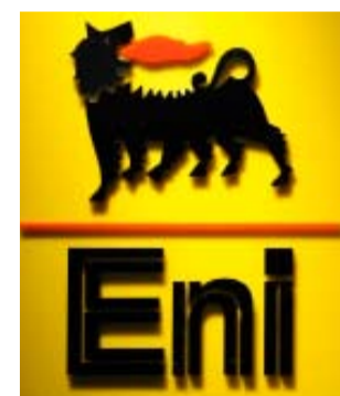
ENERGY AND SUSTAINABLE DEVELOPMENT ENI (ITALY)