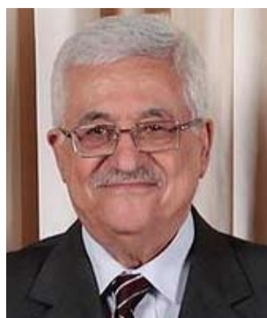
SPECIAL EDITION MAHMŪD ABBĀS (ABŪ MĀZEN) (PALESTINE)

For the action taken in favor of human rights and the defense of the natural environment as a tool for dialogue and cooperation between peoples.