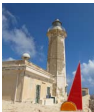
PEACE ISOLA DI LAMPEDUSA (ITALY)

For the high symbolic value, integration and coexistence with thousands of dispossessed – in search of dignity, life and future – with which the inhabitants of Lampedusa have twisted relationships of solidarity and friendship, creating a great hybrid of civilization.