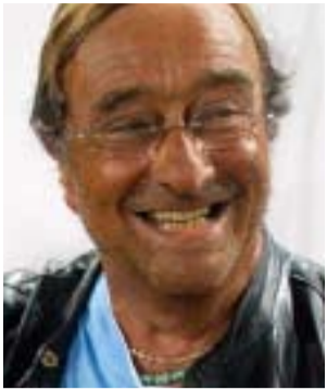
ART AND CREATIVITY IN MEMORY OF LUCIO DALLA Singer songwriter (ITALY)

His artistic temperament above all found its expression in the "Sea", the Mediterranean, which he travelled upon so many times, and where he found inspiration for his most beautiful and universal compositions. The Mediterraneanity of Lucio Dalla transpires and gathers force in a mix of sounds, cries, whispers, musical murmurs, verses, grimaces, warbling and emotions which are deeply touching, leaving a pallet of indelible colours that communicate in other languages whose origins are found in different cultures, traditions and faiths.