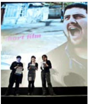
CINEMA DEDA (ASPETTANDO MAMMA/ WAITING FOR MUM) by NANA EKVIMISHVILI

Per il suo impegno nella salvaguardia dell'ambiente e la costruzione di coalizioni e per il suo importante lavoro di diffusione della cultura del mare. Un esempio educativo per le generazioni future e da trasmettere a tutti i Paesi del Mediterraneo, al fine di diffondere i valori dell'amore per il mare e la tutela del suo habitat.