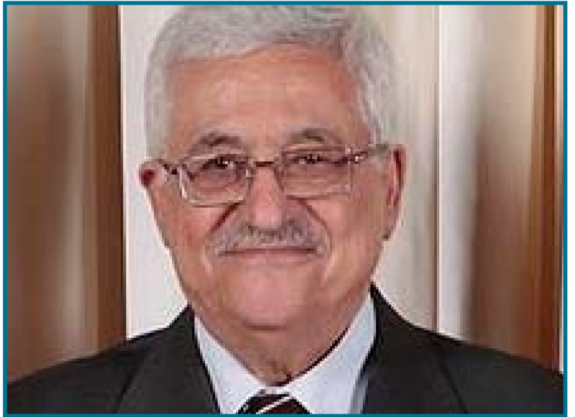
Mahmūd Abbās (Abū Māzen) – Mediterranean Award