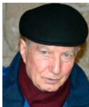
INTERRELIGIOUS DIALOGUE IN MEMORY OF CARDINAL CARLO MARIA MARTINI (ITALY)

The President of Uruguay, José Mujica, is a virtuous example of dedication to the "Common Good" helping the most vulnerable and needy members of society. In a world that is increasingly mobbed by self-interest where every social, political and religious space abounds with "Love for Power", he has been able to give a voice, sense and strength to the "Power of Love". This means living humbly and showing through his acts that power need not change people, but can even reveal their deeper essence.