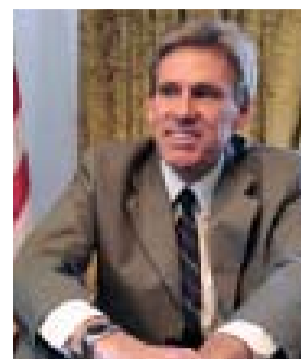
DIPLOMACY IN MEMORY OF CHRIS STEVENS US Ambassador to Libya (USA)

He was a father of the Church and an illuminated Guide revealing universal truths and leading an exemplary life. He was not only an intelligent and learned scholar of biblical studies but also a passionate Evangelist who always steered clear of partisan interests, enlightening his fellow men with the warmth, love and truth that guided his choices. In a society that is still lost in the wilderness of material desires, his testimony was that of beauty, openness and nobility of spirit. He lived and taught us how to live and interpret our daily lives so that the Mystery of Life could be revealed to us.