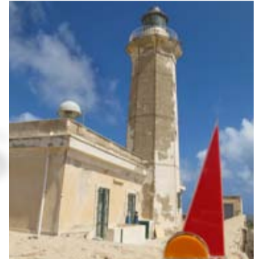
Isola di Iampudusa – Mediterranean Award