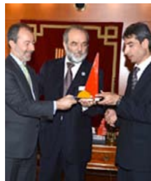
SOCIAL SOLIDARITY GENERAL UNION OF CULTURAL CENTERS – GAZA (PALESTINE)

For their efforts to integrate migrants in the geographic area of Agro Aversano and for their commitment to civil action for the promotion of fundamental rights and asserting social justice. The association was founded in memory of a south African immigrant who was killed in Italy and it bears testimony to the civil commitment against any form of abuse of power in affirmation of the rights of the most vulnerable in our territory where the Camorra is rife.