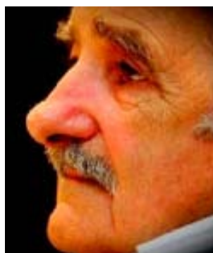
INSTITUTIONS JOSÉ MUJICA President of Uruguay (URUGUAY)

As an accomplished negotiator, he has taken dialogue beyond the confines of those involved the Peace Process itself, successfully advocating that the only way forward is through peaceful coexistence both in the Middle East and throughout the rest of the world.