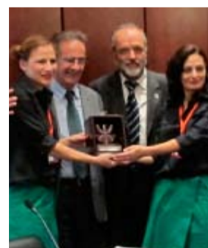
EUROMED AWARD TEATRO VALLE OCCUPATO (ITALY)

The Fondazione Antonino Caponnetto continues to apply the principles adopted by the renowned judge throughout his life and work by promoting initiatives and publications focusing on young people and preparing them to become the protagonists of the future based on the principles of sobriety, solidarity and deeply rooted in legality at all levels of society.