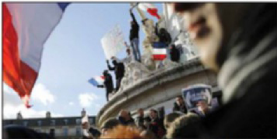
Demonstrators waving flags on the march at the centre of the Place de la République before the marchers' departure yesterday.

PLAIS THE CAPITAL OF THE WORLD TODAY, SAYS BOLLARDI