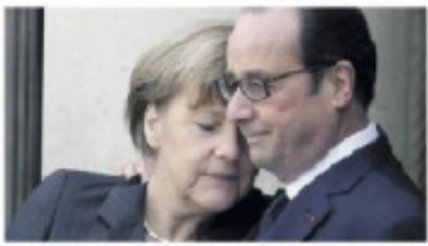
Angela Merkel and François Hollande (below) in Paris where people held up to 200,000 signs for the victims of the Charlie Hebdo attacks that died by terrorists.

the compact, when it came, people felt the need to speak about their differences, ethnic, religious and social backgrounds while holding signs that said "Innocence, freedom, republic", almost as if proving that goodness could never be victorious in dividing a nation, not to mentioning the very essence of European institutions. My own overwhelming feeling was may this spirit of resistance last. May this be a gripping point of news again. May this stand for the rest of our lifetime. Not only for France, but also for a Europe where we know what to break – however much of a difficulty they may be – are growing, and where people will not accept that we are also on the rise. But what if it comes to the 11/9/11/9/11, unlike the 11/9/11 occupation, this was not an attack from afar, this was a direct attack on our borders. It was a war on our land that appeared from within France. The financial, industrial, small business who associated it people in Paris were young French nationals. They were born and educated in France. This has never gone a long way to explaining why there was such an outpouring of grief and anger, and the need to reaffirm France's values by a show of government's democratic strength. Just as important was the presence of many European leaders and officials. It was not only about victims, but about ensuring what Europe is supposed to be about – tolerance, fundamental rights, rule of law. The articles appear with