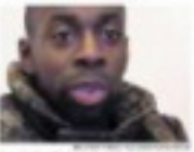
London... (On video, attacker pledges loyalty to ISIS...)

Paris... (On video, attacker pledges loyalty to ISIS...)