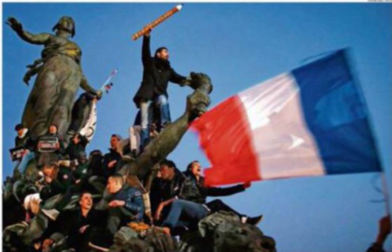
The Triomphe de la République statue is engulfed during a massive show of international support for the victims of last week's terror attacks, "Paris in the capital of the world today," said President Hollande.