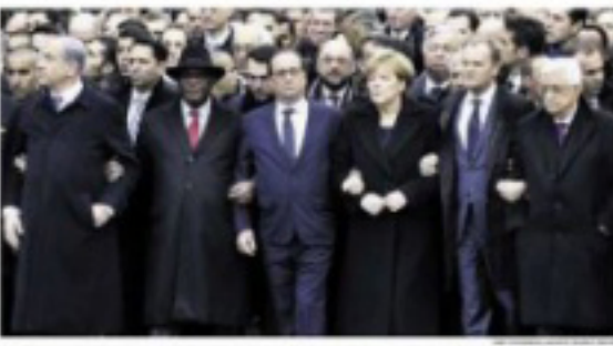
President François Hollande... (The world stands with France...)

modern French history... (Paris in a display of unity...)