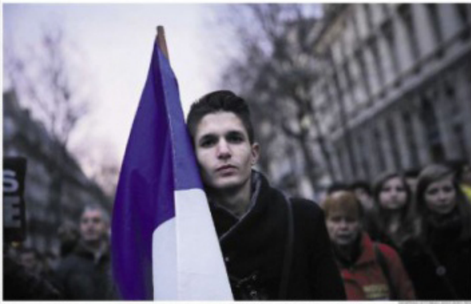
Protest demonstrators in Paris today... The banner... (The world stands with France...)

Corrosion in Paris in a display of unity after terrorist attacks