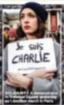
SOLIDARITY A demonstrator in Trafalgar Square yesterday at a London march in Paris

'They tried to bring France to its knees, instead they brought Europe to its feet'